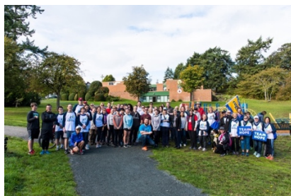
Defeat Depression Run

This year, we were proud to be able to participate as an operating clubhouse at the Defeat Depression Run, Quadra Days and The Victoria Day Parade. Members and staff together were actively engaged in all the preparation, volunteerism and joy from being a part of something so much bigger in educating the public about mental illness and help dispel stigma.