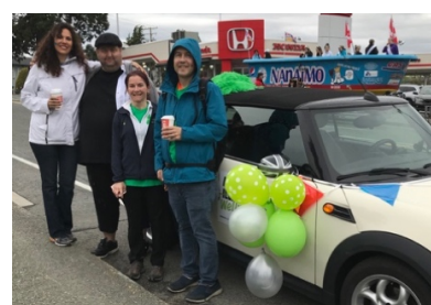
Victoria Day Parade